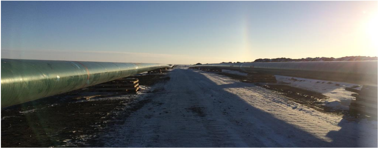
755 + 066 Pipe strung and prepped for lowering in