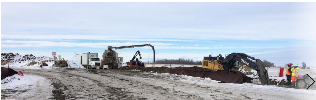
Stoney Creek HD Bore at access road