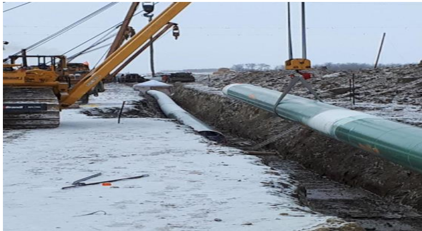
721 + 632 lowering pipe