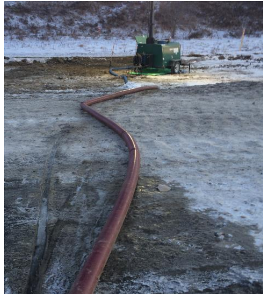
The Little Pipestone Creek Excavating ditch, Pumping water and sand pipe installation