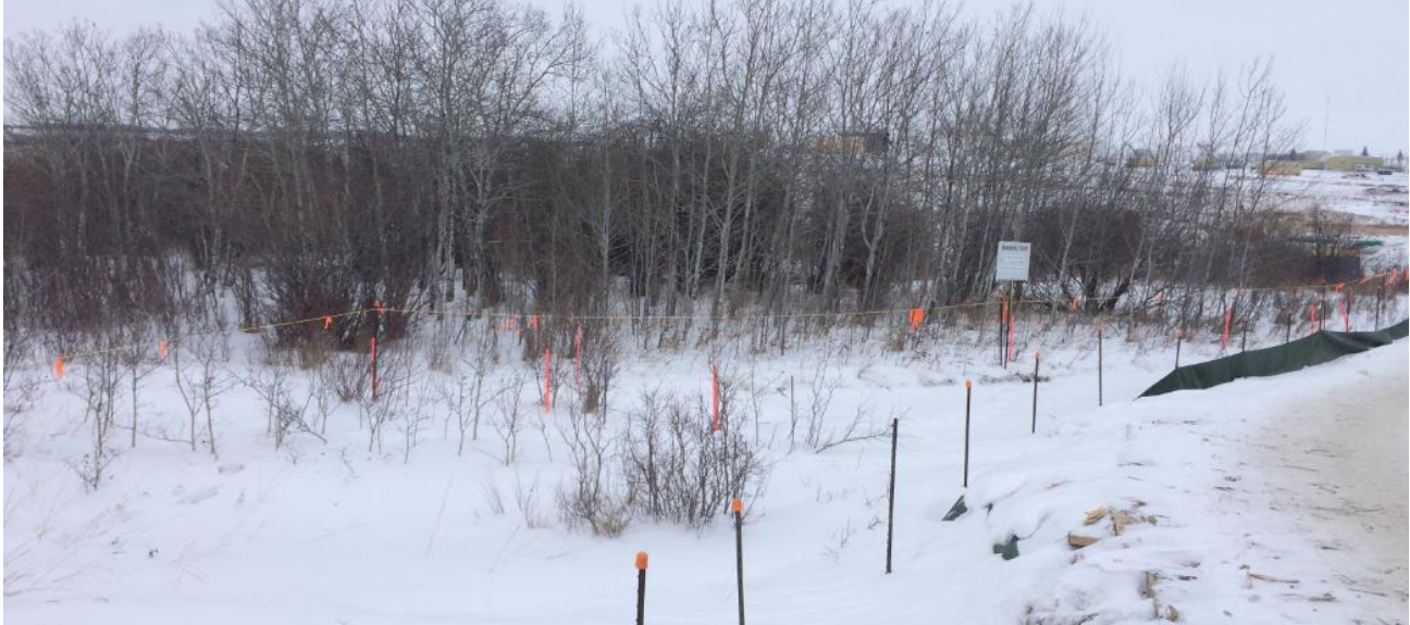
East side of the Pipestone Creek area of interest roped off