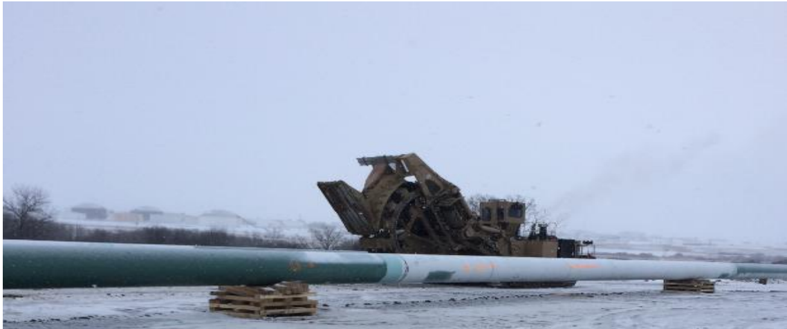
802 + 562 ditch wheel