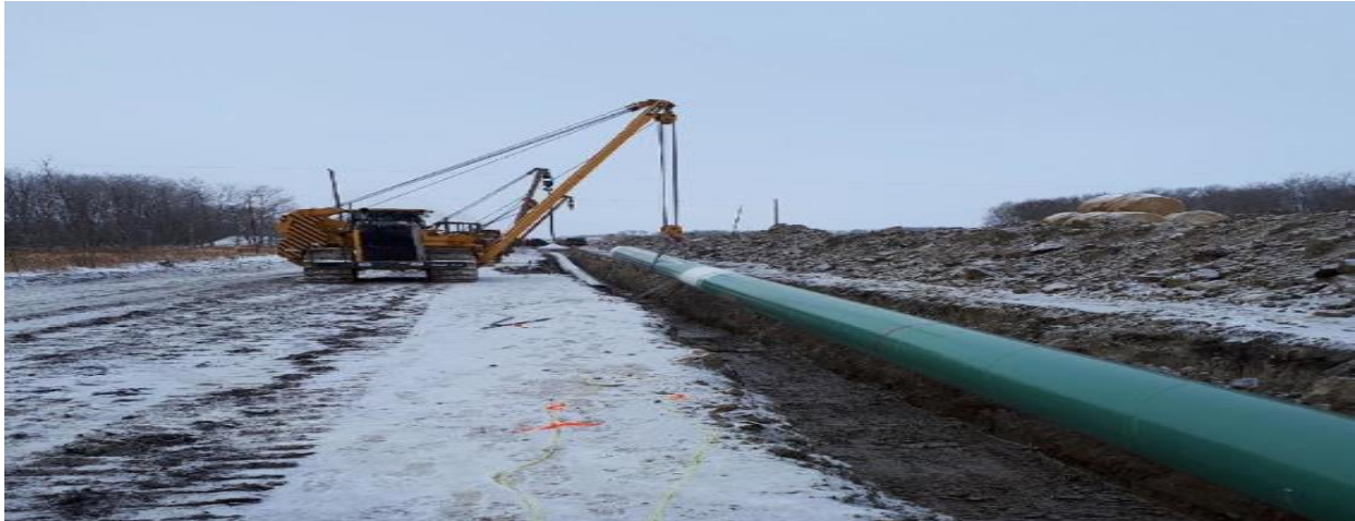
735 + 081 Lowering pipe into ditch