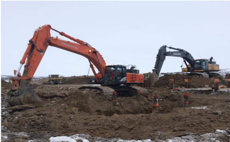
West Pipestone Creek Excavating ditch