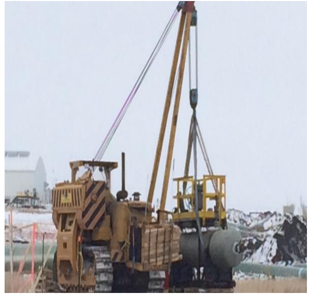
East side of the Pipestone Creek – Hoarding for test pipe string & removing test head.