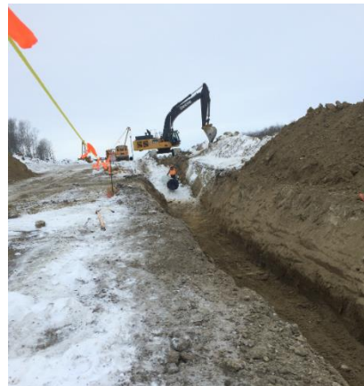
784 + 842 Excavating ditch lines