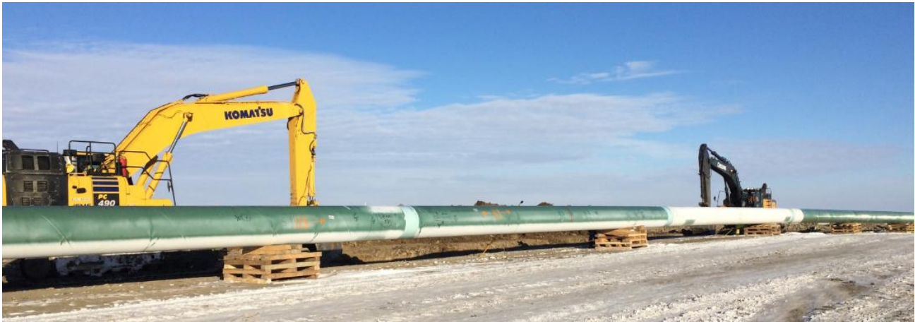
Excavating ditch line 802 + 562