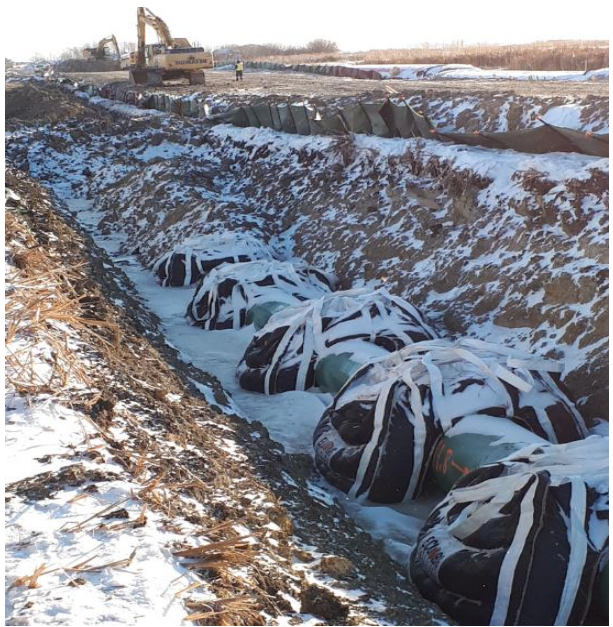
Eco bag weights placed on pipe in wetlands and coconut matting placed on top for wetland restoration